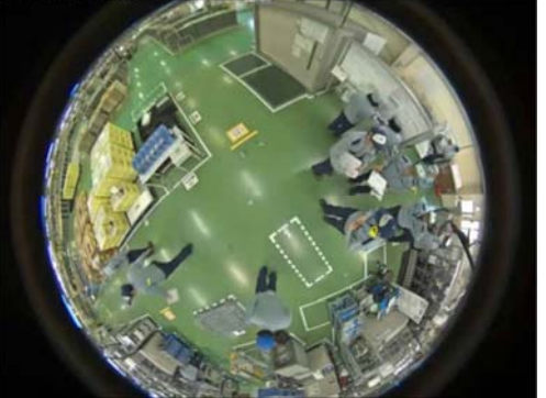
Examples of front-line worker / facilities sensing using image analysis system

Tokyo, July 13, 2016 -- Hitachi, Ltd. (TSE:6501, "Hitachi") announced today that in collaboration with Daicel Corporation(TSE:4202, "Daicel"), it has developed an image analysis system that supports quality improvements and increased productivity by detecting signs of operational failures in production line facilities and deviations in worker activities on the front lines of manufacturing.