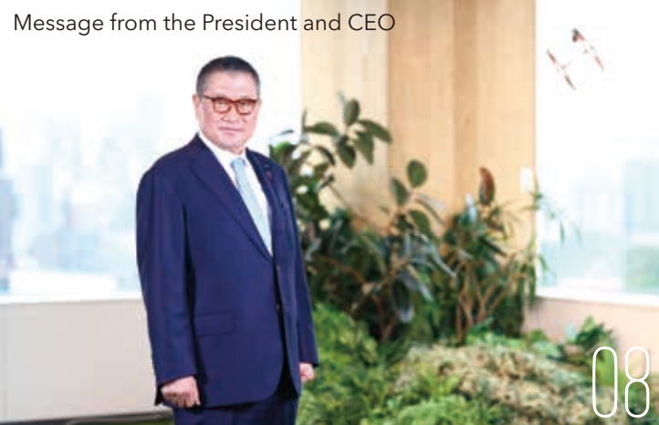
Message from the President and CEO